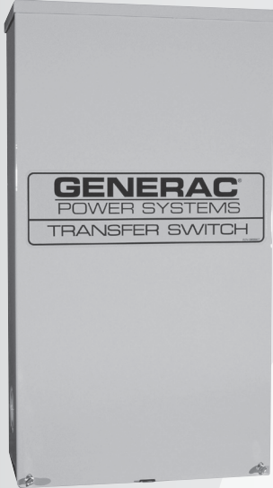
100 – 400 Amp RTS NEMA 3R